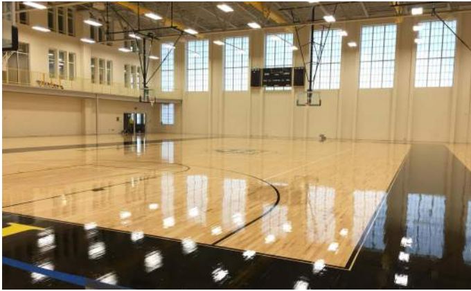
Floor Striping in Competition Gym