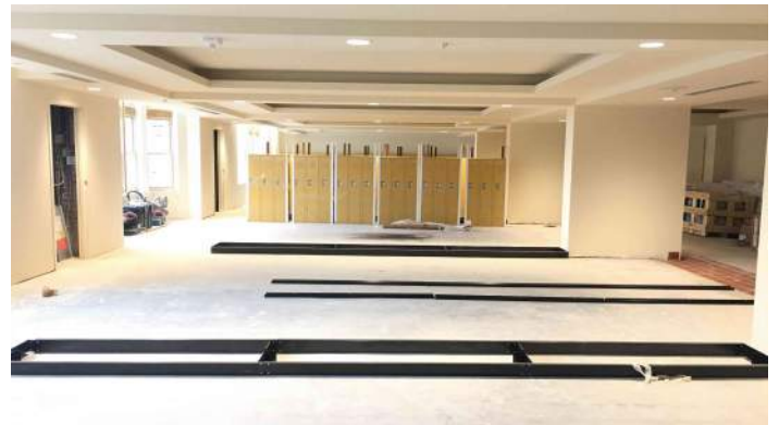
Locker Installation in 2nd Floor Area G