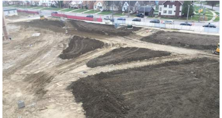
Grading in Courtyard Along Cedar Rd.