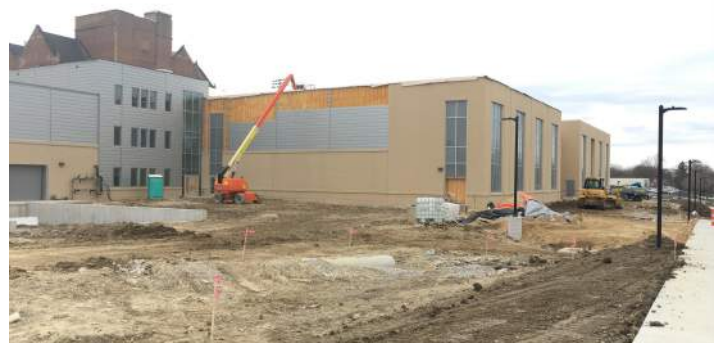
Grading Along Washington Blvd.