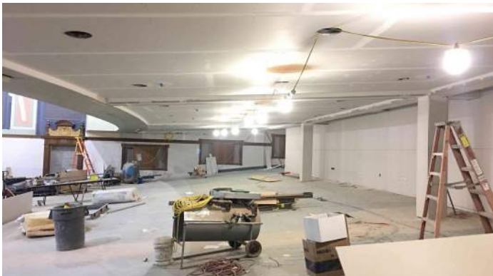
Drywall Installation in Cedar Level Auditorium