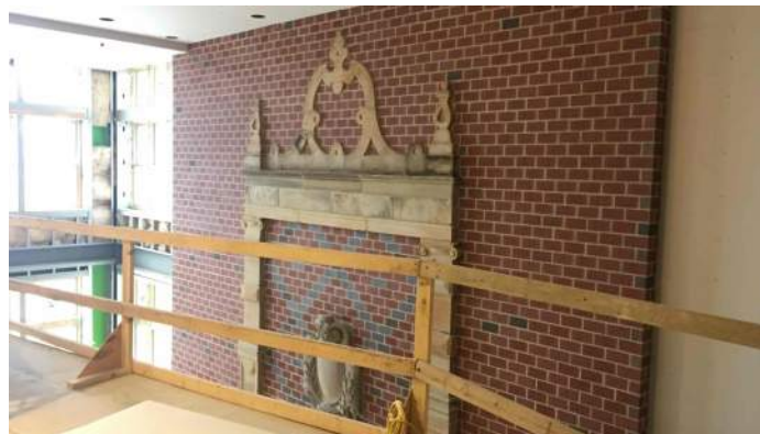
Interior Veneer Stone Area F Atrium